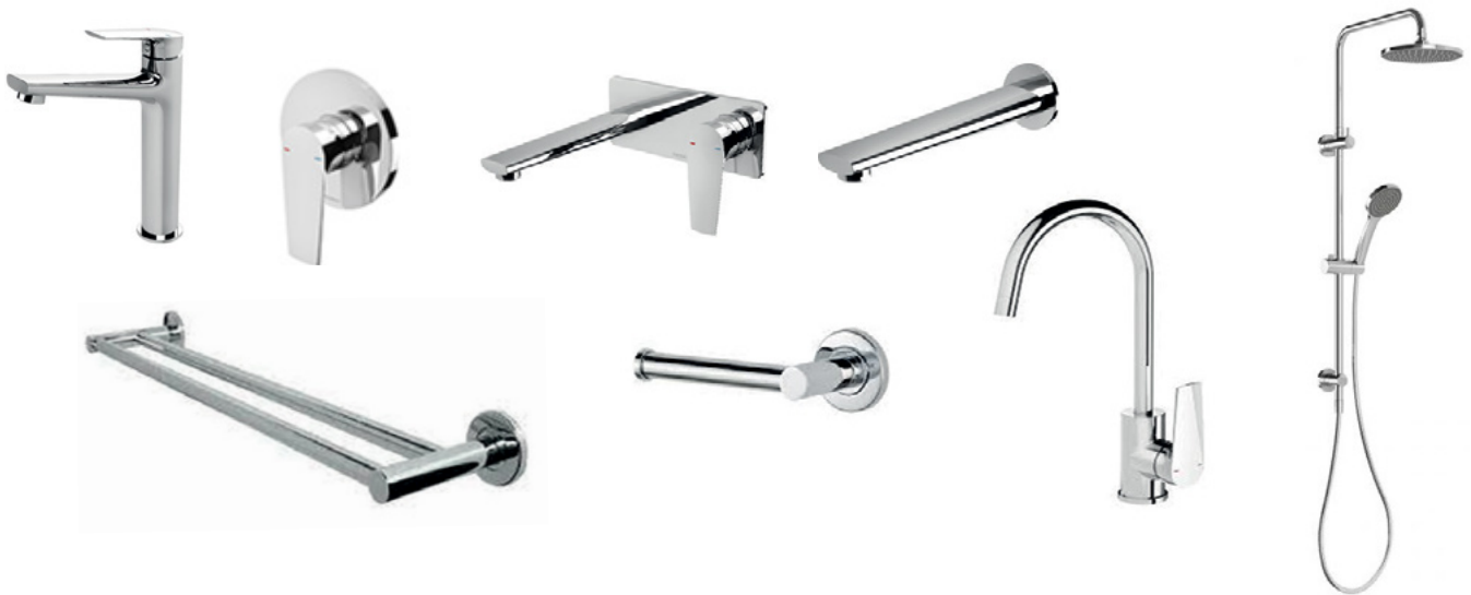
Tapware Collection Pina (Brushed Nickel, Black or Chrome)