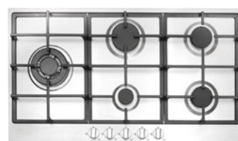
Gas Stainless Steel