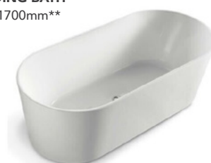
PRATO FREESTANDING BATH 1500mm or 1700mm**