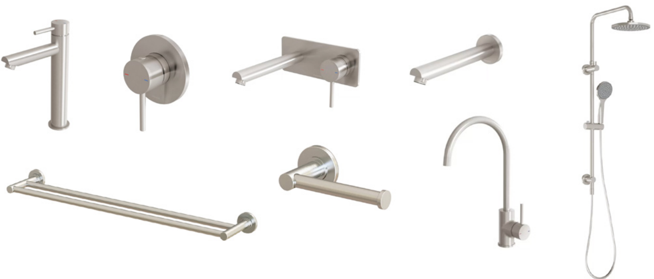
Tapware Collection Teva (Brushed Nickel, Black or Chrome)