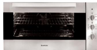
Stainless Steel glass