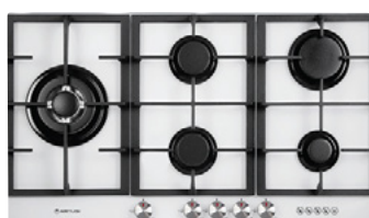
Gas White / black glass