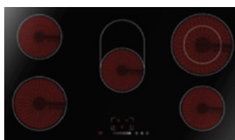
Electric Ceramic black