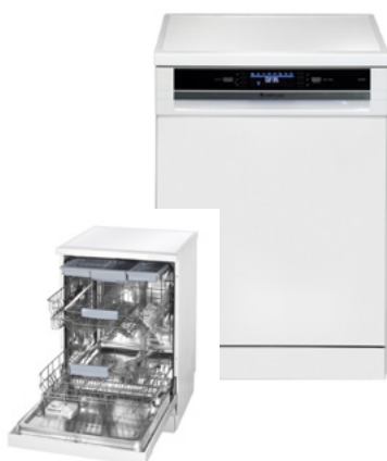
ARTUSI 600mm Freestanding Dishwasher