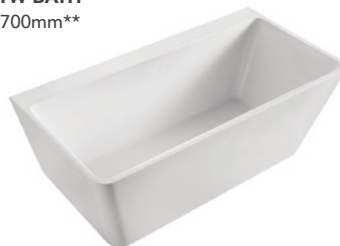
HARMONY BRUNETTI BTW BATH 1500mm or 1700mm**